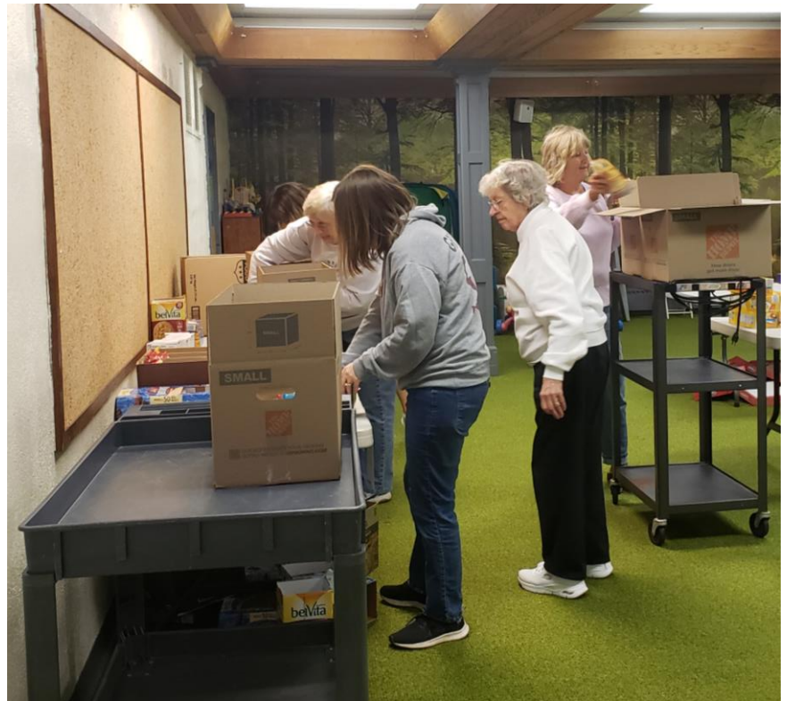
Boxes of food being packed for delivery to seniors on Saturday, September 24