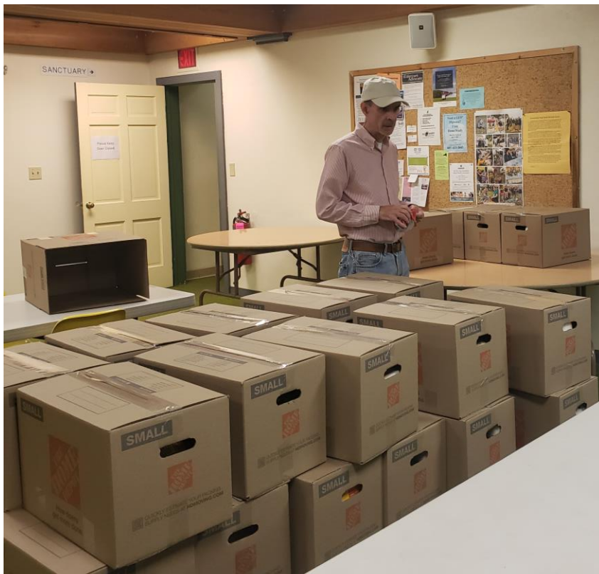
Boxes of food wait to be loaded into vehicles for delivery.

On Saturday September 24th we distributed boxes of food to the senior center, Buena Vista and 16 or more seniors who had contacted me to receive a box. These