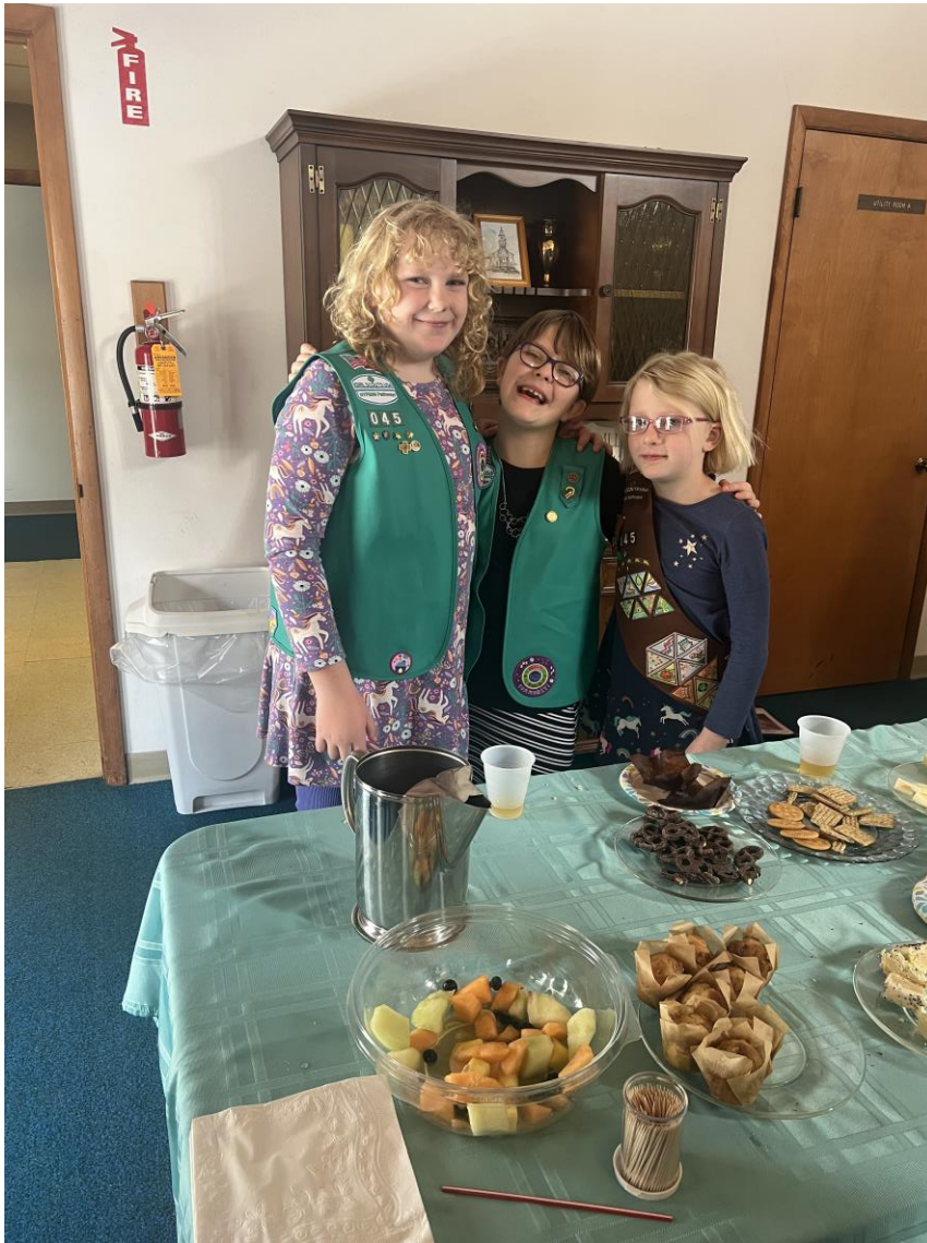
March 12 was Girl Scout Sunday and Coffee Hour was hosted by the girls of Troop 61045.