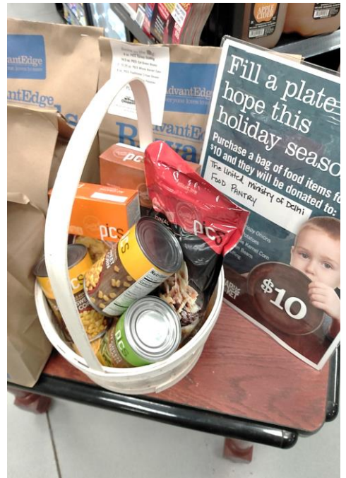
Fund Raiser at Price Chopper to benefit the Food Pantry at UMD. Through the end of the year, shoppers are asked to purchase pre-filled bags of food for $10, which are then donated to our Food Pantry.