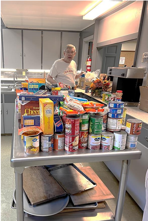
Sorting and putting away some of the many donations received during the month of November, thanks to our very generous community!